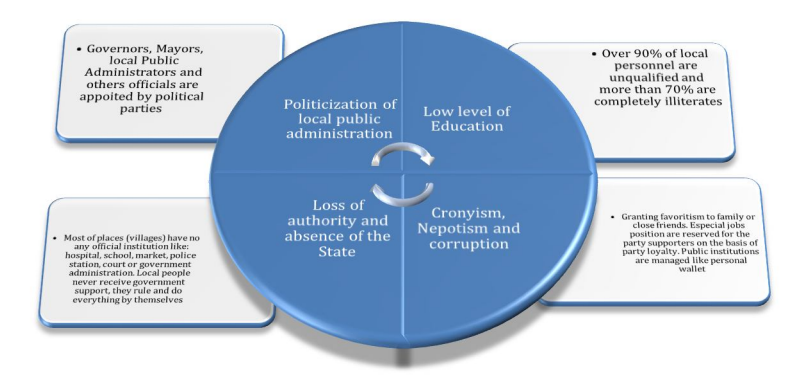
Figure – 2